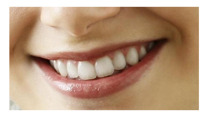
Information and frequently asked questions on