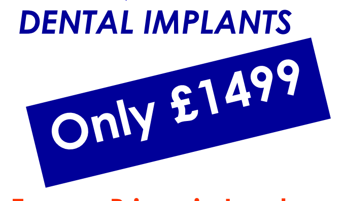
Europe Prices in London No travelling to Poland or Turkey

63a Wilton Road Victoria, LONDON SW1V 1DE